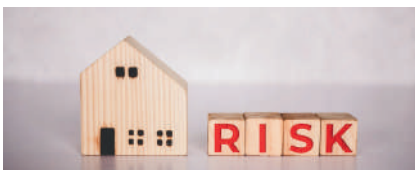
PROPERTY ALL RISK