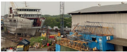
SHIP REPAIR'S LIABILITY (SRL)