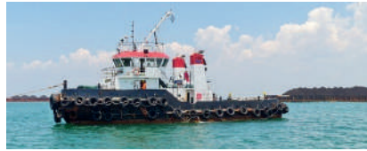
HULL & MACHINERY (H&M)