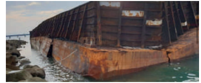
WRECK REMOVAL AND OIL POLLUTION (WROP)