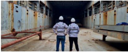
PROTECTION AND INDEMNITY (P&I)